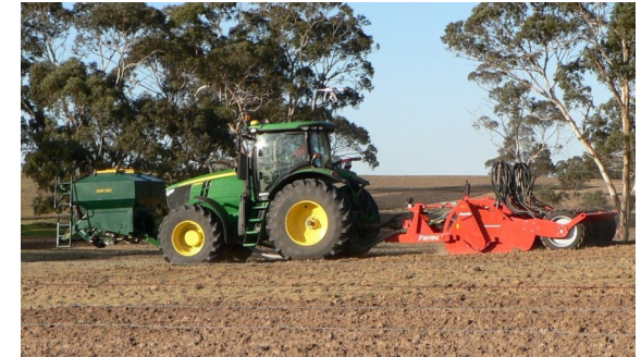
Seeding and spading in one pass