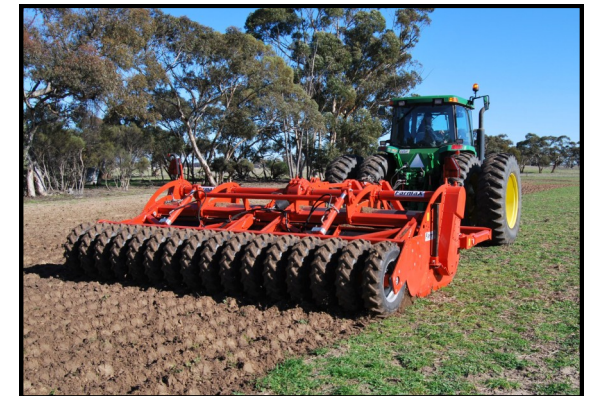
Defined ridges behind 4.5m Farmax Spader